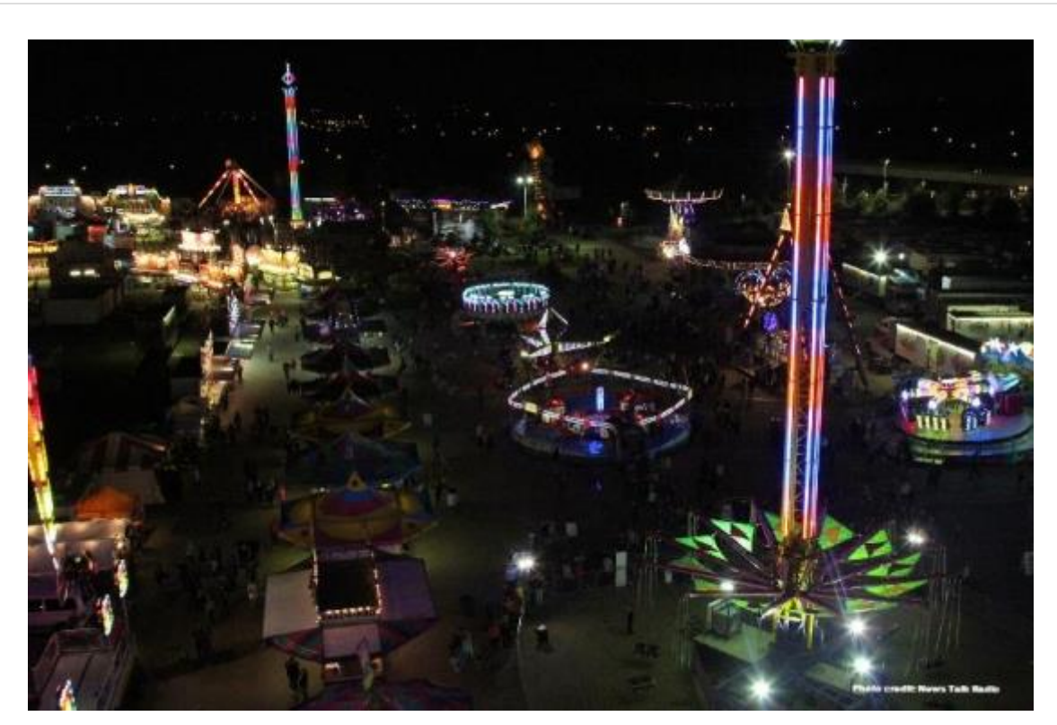
Congratulations to the 2013 Saskatoon Exhibition organizers, staff, and volunteers who did an outstanding job to make the 2013 exhibition so successful.

The exhibition is always one of our family's highlights of the summer. We had a fantastic time again this year. The total attendance reached 220,008 and I am sure that everyone who passed through the gates had a great time!