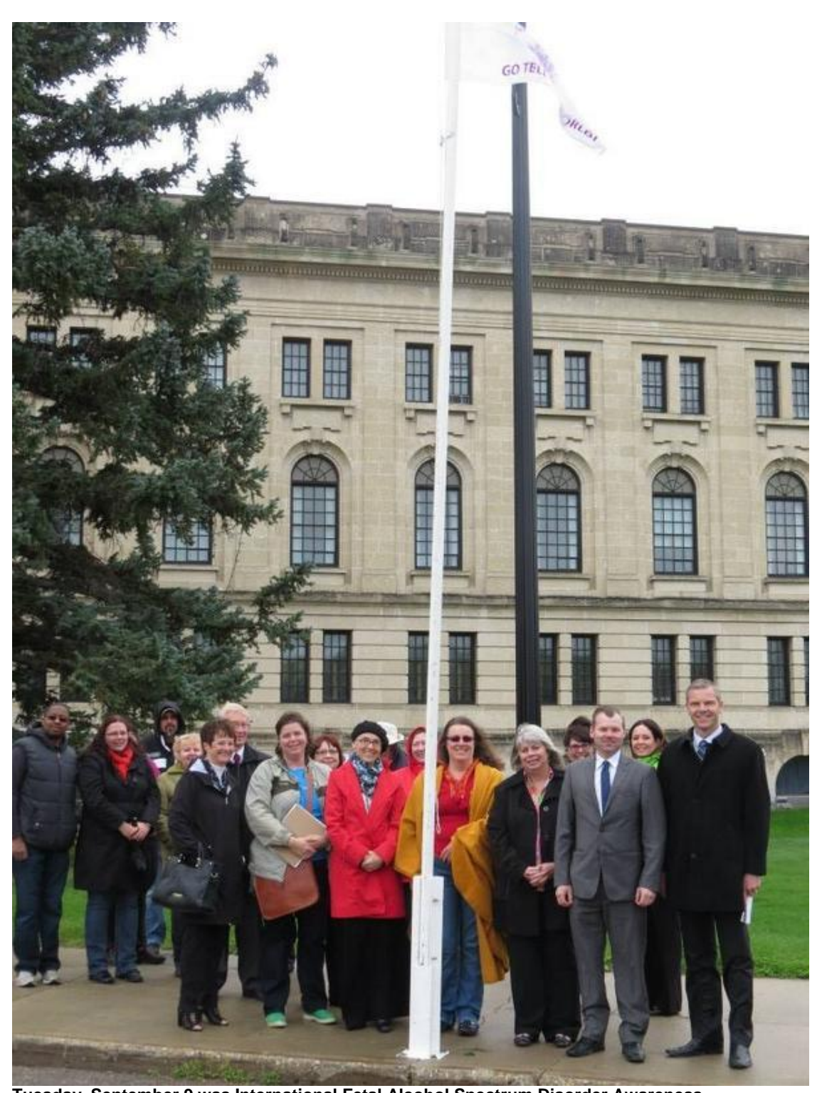
Tuesday, September 9 was International Fetal Alcohol Spectrum Disorder Awareness Day. Minister Dustin Duncan along with other dignitaries raised a flag at the Legislature to promote awareness.