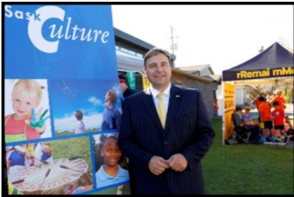
Pictured above, I attended events held in Sutherland

Culture Days raises awareness, accessibility, participation and engagement of Canadians in the arts and cultural life of their communities. With the support of volunteer groups, hundreds enjoyed the many activities held throughout Saskatoon last week. Culture Days is a collaborative initiative that everyone can play a role in. Whether you are passionate about arts and culture or curious to discover new cultural experiences, there was an activity you could participate in and contribute to Culture Days!