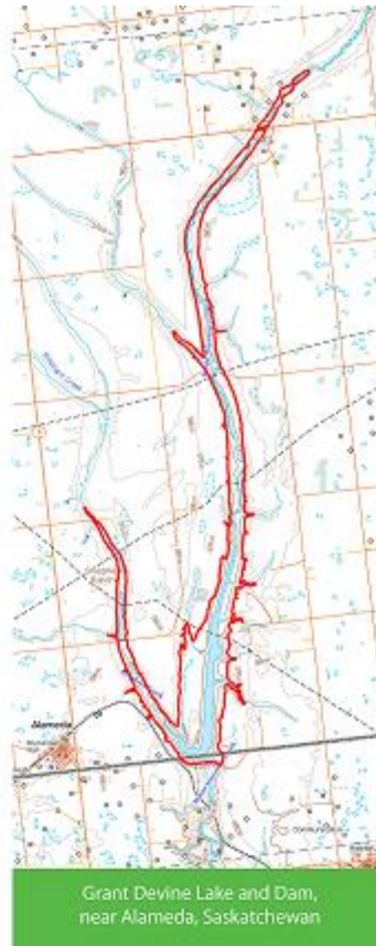
Grant Devine Lake and Dam, near Alameda, Saskatchewan