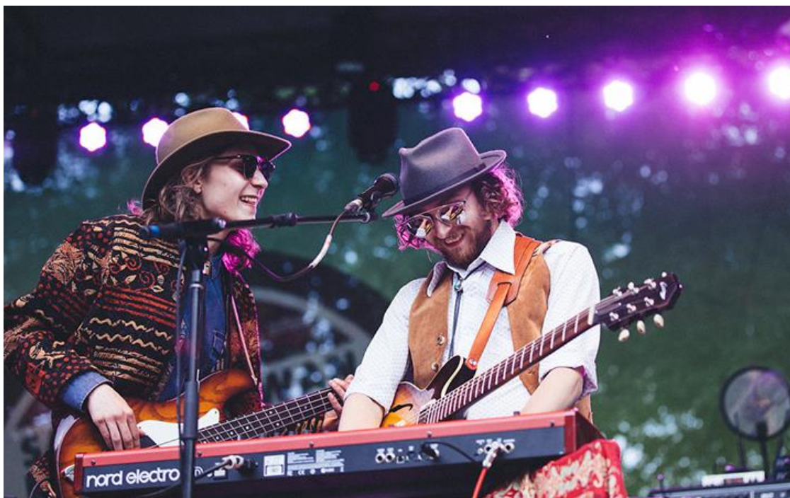
Bombargo, 2017 Festival, Photo by: Nicole Romanoff Photography

Local artists take note! Applications to perform at the festival are now open until Friday, January 12th, 2018. Local artists have the opportunity to perform on the Potash Corp Club Jazz Free Stage, which attracts the largest crowds of the Festival, and many other clubs and venues around Saskatoon! Mark you calendars - June 22 - July 1 for the Jazz Festival.