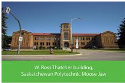
W. Ross Thatcher building, Saskatchewan Polytechnic Moose Jaw