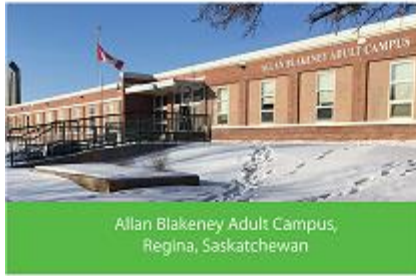
Allan Blakeney Adult Campus, Regina, Saskatchewan