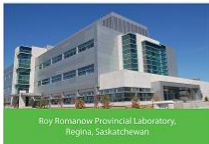
Roy Romanow Provincial Laboratory, Regina, Saskatchewan