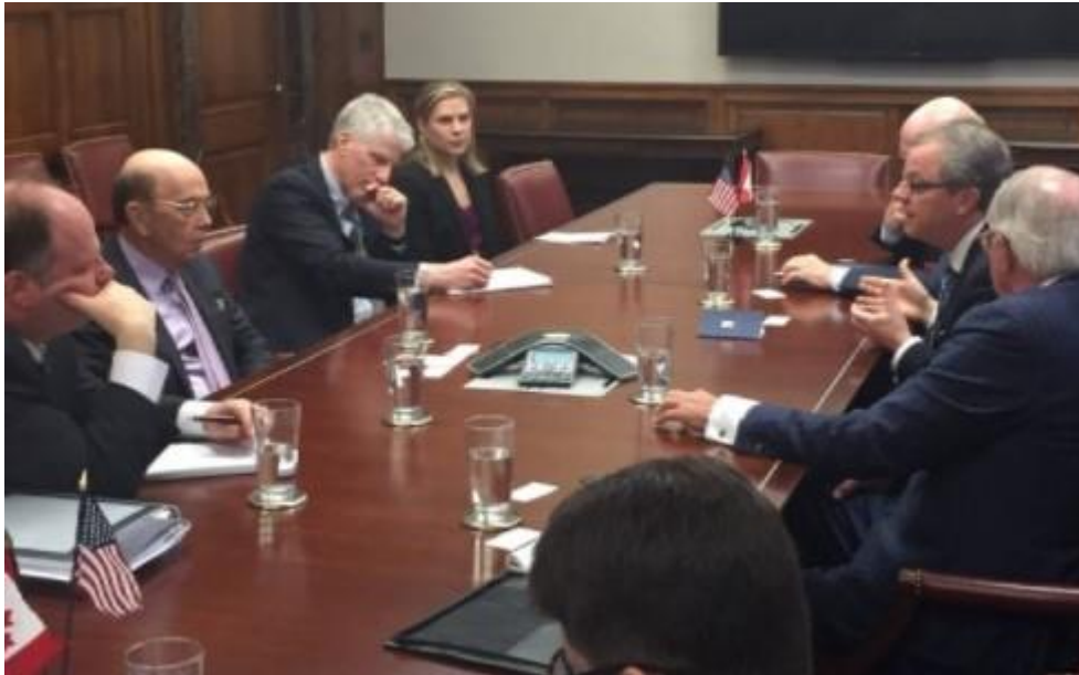
Wall Made Case for Free Trade with New Administration and U.S. Legislators

Premier Brad Wall concluded his trade mission to Washington, D.C. where he promoted the continuation of a strong trade relationship and free trade between Canada and the U.S. as a benefit to both countries.